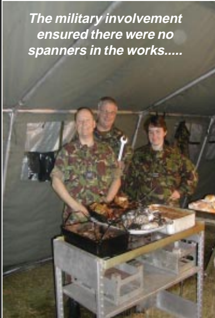
The military involvement ensured there were no spanners in the works.....

In the FIDF -provided food tent people were treated to a wonderful stew laid on by the military. The weather did get chilly as the night went on and the timely serving of food ensured that everybody felt ready to go and ready for some more dancing after a good feed. The sheep provided by Fitzroy Farm formed the basis of a great BBQ as well!