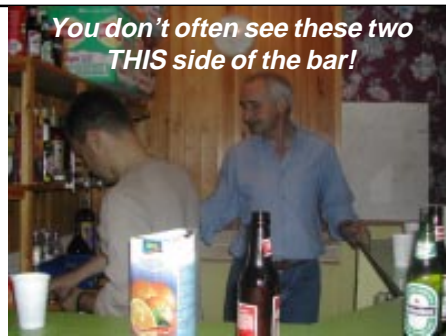
You don't often see these two THIS side of the bar!