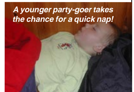
A younger party-goer takes the chance for a quick nap!

Because of the licence used at Fitzroy Farm, one of the nicest things about the Campers Bash was that families could come as well, meaning parents from camp and town could bring children to enjoy the evening too - although it did prove too much for some!