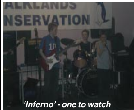
'Inferno' - one to watch

The talented band Inferno, with members under 14 years old, played seven songs, including popular material from the Red Hot Chili Peppers. This was one of the first public gigs the boys had done and from the feedback that we got, the first of many!