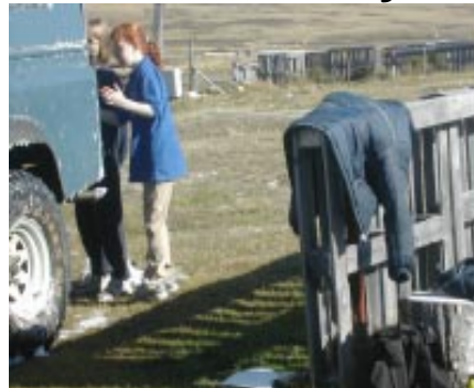
The Falklands Conservation Rover gets a thorough cleaning out by eager Watch members

Over the winter months, the Watch Group will be working towards their Gold Award, which is divided into eight separate badges, each focussing on environmental issues, from 'Soap box' where they have to give a presentation on an issue they feel strongly about - how to spread the word and influence opinions, through to 'Wildlife Action' where they actively repair a site and monitor what happens following their work. Many of the children are doing well and we will report back on their progress.