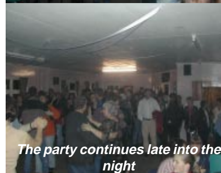
The party continues late into the night