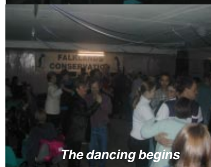
The dancing begins