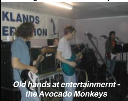
Old hands at entertainment - the Avocado Monkeys

The talented band Inferno, with members under 14 years old, played seven songs, including popular material from the Red Hot Chili Peppers. This was one of the first public gigs the boys had done and from the feedback that we got, the first of many!