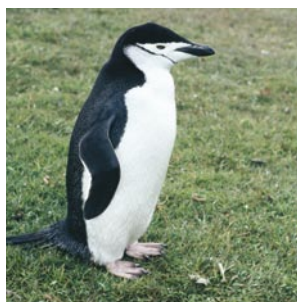
Chinstrap penguin, one of the more unusual sightings of the year, seen on the Mount Kent road.

Soft-plumaged petrels are regular summer / autumn visitors to the offshore waters surrounding the Falkland Islands (White et al. 2002), however, they are infrequently sighted from land. On 9 January one was seen off Hookers Point (PM) and between 21