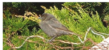
The shiny cowbird – first recorded in the Falklands in 2002.

Between 7 and 20 April a shiny cowbird was present at Johnson's Harbour settlement (GS and JS). This was the first record of this species within the Falkland Islands.