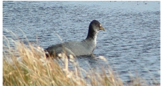
Red-gartered coot, Cape Pembroke.