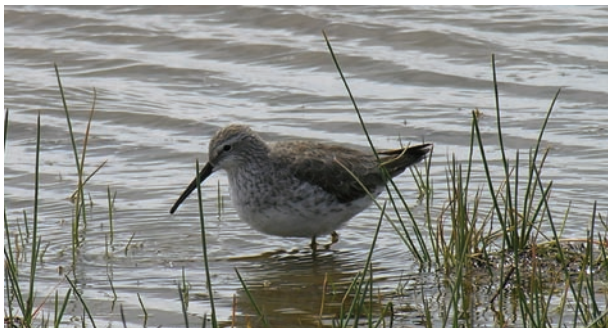
Stilt Sandpiper, Fox Point.