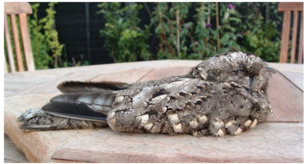
Band-winged nightjar.