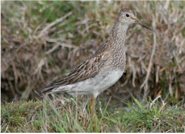
Pectoral Sandpiper