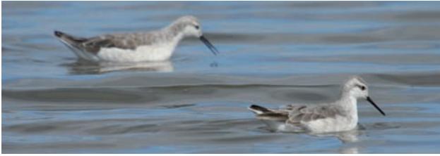
Wilson's Phalaropes