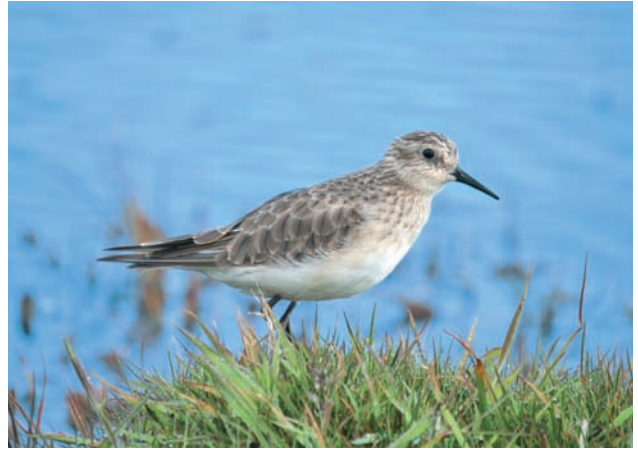
Baird's Sandpiper