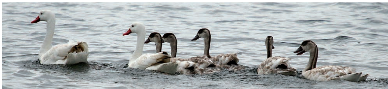
Coscoroba Swans (Alan Henry)

A single male was seen near Fitzroy settlement on 24th July by Allan Eagle, a single male Cinnamon Teal was also seen at Island Harbour creek (Micky Reeves) on 28th July and by Allan Eagle on 2nd August, and where the road crosses the Fitzroy River on 29th July (Sue & Mike Morrison). Seen by many observers and photographed at Fitzroy River over the next few months the last report was on 14th November (Brian Aldridge). It is probable that all of these sightings were the same bird. Alan Henry also saw a single male at the Big Pond in Whale Point, Fitzroy, on 25th November.