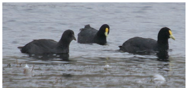
White-winged Coots (Alan Henry)

Five birds on the north side of Cape Pembroke on 2nd January (Sue & Mike Morrison). A single bird at Whale Point, Fitzroy, on 8th January (Alan Henry & Vaughan Ashby). Two birds were seen by Alan Henry on 10th October at Cape Pembroke and a single bird at the small ponds on Cape Pembroke on 19th October (Alan Henry). A single bird at Bull Point, North Arm, on 20th October (Sue & Mike Morrison). Eight birds seen south of Yorke Bay Pond, Cape Pembroke, on 11th November (Alan Henry). Five birds on the gravel runway, Cape Pembroke, on 12th & 13th December (Alan Henry).